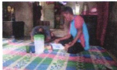
Figure 1. A Shaman is Communicating with the Spirit Through Intermediary

implementation, as well as inviting Bedincak (dancing) the Kedidi dance. Calling and communicating with these delicate beings through mediators or intermediaries, the male disciple of the Shamans.