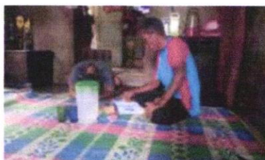
Figure 1. A Shaman is Communicating with the Spirit Through Intermediary

implementation, as well as inviting Bedincak (dancing) the Kedidi dance. Calling and communicating with these delicate beings through mediators or intermediaries, the male disciple of the Shamans.