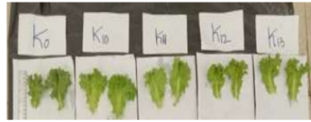
Picture 1. Condition of lettuce leaves on various types of media

The results of the variance showed that the planting media treatment had no significant effect on plant height in weeks 1,2,3, and 4, leaf length in weeks 1 and 2 and the number of leaves in weeks 1,2,3, and 4. Planting media treatment had a significant effect on nutrients on leaf length variables in week 3 and 4 (Table 1.)