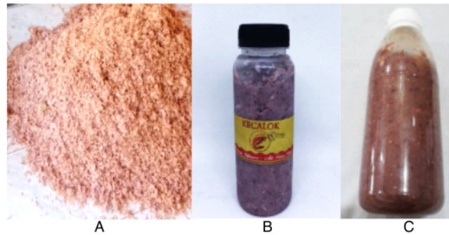
Figure 2. Rebon ( Acetes sp.) (A) and product of kecalok from Bangka island (B, doc. LCK), and product of kecalok originated from Palembang, Indonesia (C)

Benjakul, Sampavapol, Osako, and Faithong (2014), in which the value of E^* (total difference of color), and C^* (the difference in Chroma) were calculated as follows: