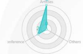
Scopus GScholar WOS