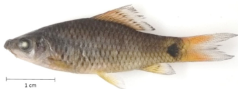
Fig. 1. Specimen of Osteochilus spilurus .

We found fishes from the five sampling sites in the Bangka and Belitung Islands have been described as Osteochilus spilurus . They have a specific morphological character of Weber and de Beaufort (1916) describe, follows: compressed body, snout pointed, dorsal height gradually rising before dorsal fin, prominent with numerous small pores, long maxillary barbels, 28-30 scales lateral line, dorsal fin rays 12-13 and start from on the 7 th or 8 th scale of lateral line, caudal fin emarginate shape, and a large black blotch on the caudal peduncle. Twenty individuals of each sampling site are labeled and immersed in a 5% formalin solution and then placed in Brawijaya Ichthyologicum Depository, Malang. Standard lengths of them ranging from 61.04 to 22.44 mm.