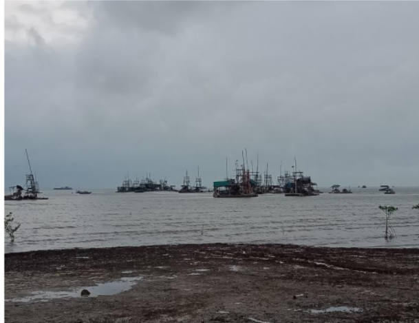
Picture 1. Production Suction Pontoons (PIP) at Lepar Beach

production not far from the shoreline. This of course has an impact on tourism areas in the future because of these mining activities.