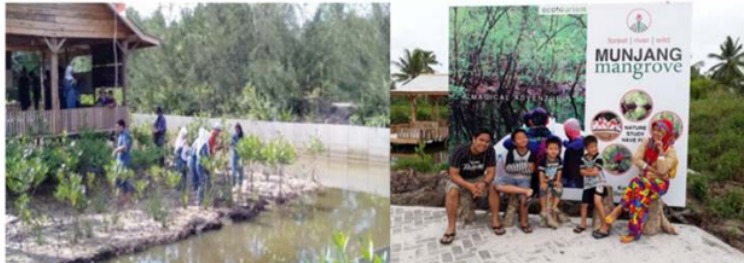
Figure 2. Mangrove area of Kurau Barat, Central Bangka

The next research locus is Rabeng Perpat Permai tourism area, which is located in the Rabeng area, Belinyu Subdistrict, Bangka Regency. Rabeng itself in the language of the local people means mangrove (mangrove forest) which is a mainstay of this tourism area. The location of this tourism area is around 80 KM from the downtown that is Pangkal Pinang and can be reached by land trip for about 90 minutes. This area is located in the coastal area and is one of the new tourism areas which has been developed by local residents. Interestingly, this area combines mangrove crab fisheries in the form of aquaculture and mangrove conservation. This area is located in the coastal area and is connected by a small river to the sea. The manager of this area has provided a tour package along the river and mangrove to the surrounding islands.