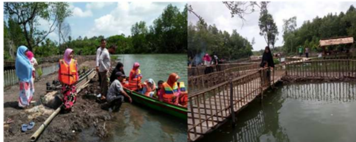
Figure 3. The Area of Rabeng Perpat Permai Belinyu Bangka

The next research locus is Rabeng Perpat Permai tourism area, which is located in the Rabeng area, Belinyu Subdistrict, Bangka Regency. Rabeng itself in the language of the local people means mangrove (mangrove forest) which is a mainstay of this tourism area. The location of this tourism area is around 80 KM from the downtown that is Pangkal Pinang and can be reached by land trip for about 90 minutes. This area is located in the coastal area and is one of the new tourism areas which has been developed by local residents. Interestingly, this area combines mangrove crab fisheries in the form of aquaculture and mangrove conservation. This area is located in the coastal area and is connected by a small river to the sea. The manager of this area has provided a tour package along the river and mangrove to the surrounding islands.