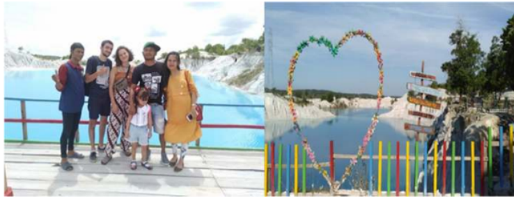
Figure 1. Kolong Biru Nibung, Central Bangka

Kolong Biru Tourism Area is located in Nibung Village, includes in the administration of Koba Subdistrict, Central Bangka Regency. This area is located approximately 75 KM from the downtown that is Pangkal Pinang. This tourism area is called as Kolong Biru because in this tourism area there is a large pit under which the water is very blue. This lake is often referred to as Kolong Danau Kaolin . The pit is a whole formed by the result of tin mining. The former tin excavation will move the soil on the surface to take the tin in it, then the former excavation will be flooded and form a pool area which is called as pit. The diameter of this Kolong Biru is approximately 100 M with a depth of approximately 25 M.