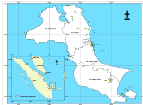
Fig. 1. Inland and offshore study sites in Bangka Island from secondary data [19]

The income percentage for tin miners compared to overall income per month of people in Lubuk Kelik, Bangka; for ex-pepper farmers in Silip, Bangka; and for ex-rubber farmers in Bencah, Central Bangka are 90% and above. Pepper and rubber plantations contribute less than 3 % each of overall monthly income [17]. The net monthly income of fishermen in Rebo and Bubus beaches, Bangka, is just about one-third of the income of their colleagues working in tin mining [18].