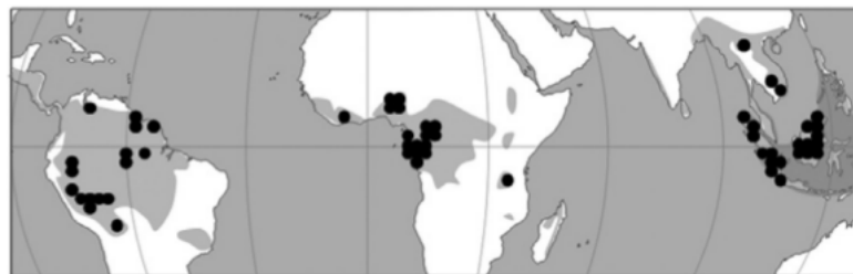
1 Figure 1 Spatial distribution of the study sites (black dots). Due to the size of the dots they can encompass more than one location. The total number of locations is: South America 33, Africa 45, Southeast Asia 42. The extent of global moist tropical forests is indicated by grey shading.