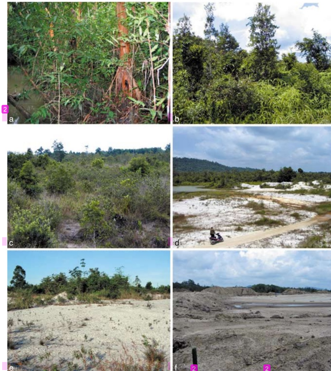
Fig. 2 Vegetation aspects of study sites. a. Riparian forest; b. abandoned farmed-land; c. 38-year old tin-mined land; d. 11-year old tin-mined land; e. 7-year old tin-mined land; f. 0-year old barren tin-mined land.

A minimum study plot size of 0.2 ha per study site was determined on basis of the species-area curve (Setiadi & Muhadiono 2001). The study was conducted on 20 contiguous plots of 10 by 10 m at each of the study sites using the modified quadrat sampling technique of Oosting 1956 (Soerianegara & Indrawan