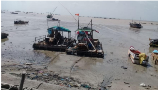
Figure 2. Unconventional Mining Pontoon on the coast of Batu Belubang village, Pangkalan Baru sub-district, Central Bangka district

change of work from fishermen to mine workers. A pontoon illustration for unconventional tin mining activities along the Batu Belubang beach is presented in Figure 2.