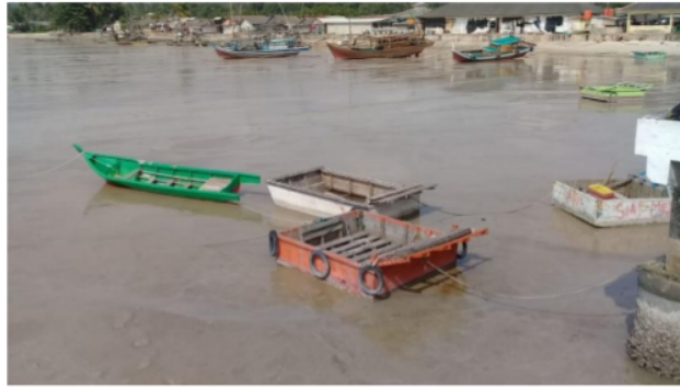
Figure 3. Barge Transportation