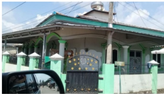
Figure 5. Mosque from unconventional tin miner funds

The results of the research showed that tin miners also help fishermen by paying a fee of 2 kilograms per day. These fees are coordinated by tin collectors, to then be deposited to the village government to help build infrastructure in the village such as houses of worship (mosques). The mosque that was built using part of the funds derived from fees from tin miners in Batu Belubang Village is presented in Figure 5. However, there are also fees that are directly given to fishermen individually.