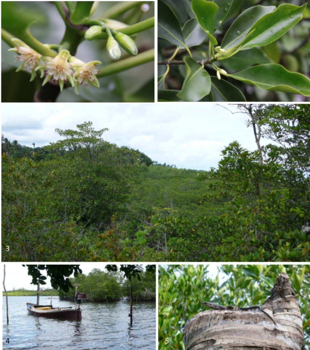
Figure 3. A new mangrove record and beautiful mangroves in Mendanau Island. 1-2. Bruguiera cylindrica , a new mangrove record in Mendanau Island found on this trip. 3. Canopy view of mangroves showing emerald green mangrove forest comprised of different taxa. 4. Mangroves provide a critical important habitat to various marine creatures. 5. A sun-bathing lizard in a mangrove forest.