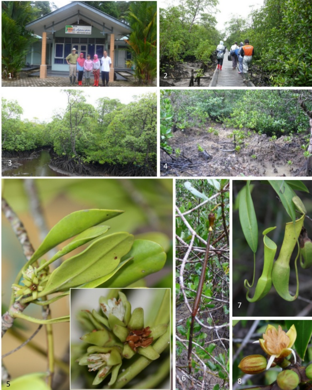
Figure 2. Selected photos of mangrove field trip. 1. Our team members. 2. Boardwalk in site 1. 3-4. Mangrove in site 1, seedlings of C. tagal are abundant. 5. Close up of C. tagal and its flowers (insert). 6. The lower part of many of hypocotyls of C. tagal are withered in site 1. 7. A pitcher plant growing very close to mangrove forest. 8. A flower of Rhizophora apiculata .