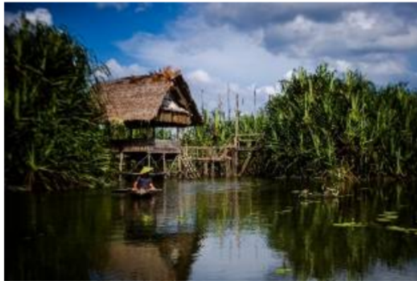
Figure 1. Tebat Rasau ancient lake.

One of the geosites of the Belitong UNESCO Global Geopark is Tebat Rasau ancient lake (Figure 1). The lake has high biodiversity, and is particularly home to ornamental arowana ( Scleropages formosus ), among fish ( Channa marulius ) and green-spotted pufferfish ( Dichotomyctere nigroviridis ) (belitonggeopark.net). According to Djapani et al (2021), freshwater and forest ecosystems in Tebat Rasau, apart from having an important role for the community, can also be a natural laboratory. For generations, local people have had the knowledge to utilize natural resources there, such as how to catch fish and use plants as spices. The Geopark concept helps add the scientific reference that the Lenggang River is the habitat of the primitive species Asian arowana ( S. formosus ) which is an endangered species and is included in the IUCN Red List.