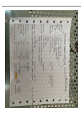
Payment proof.jpg 274K

soheil.eagderi@ut.ac.ir <soheil.eagderi@ut.ac.ir> To: fitri sil valen <fitrisilvalen@ubb.ac.id>