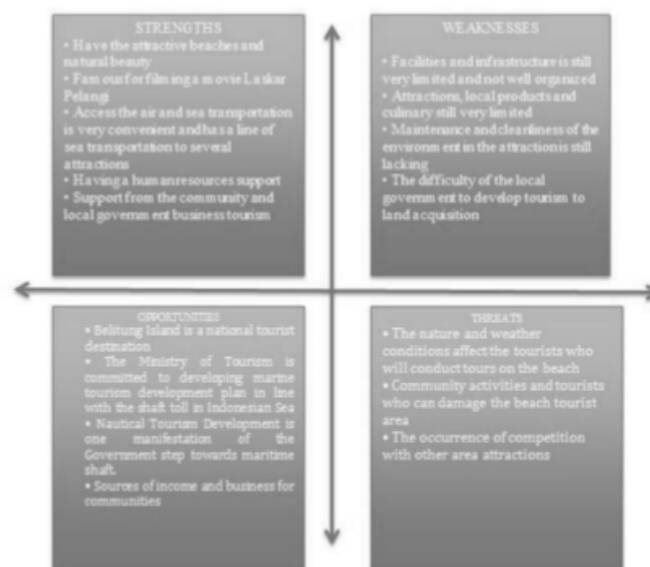
Figure 1. SWOT Analysis Tourism in Belitung Island