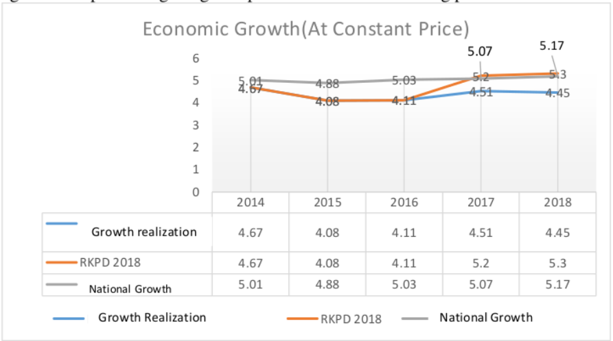
Figure 1. Economic Growth Rate (ADHK)

The data shows that economic growth in Bangka Belitung has slowed down due to the factor of tin business which is getting smaller and the price of agricultural products getting cheaper. Consider the following picture: