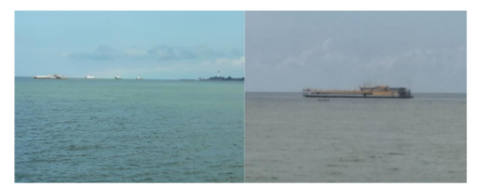
Fig 1. KIP in Mentok Coast

Below are some pictures of KIP present and operation along the Mentok coast.