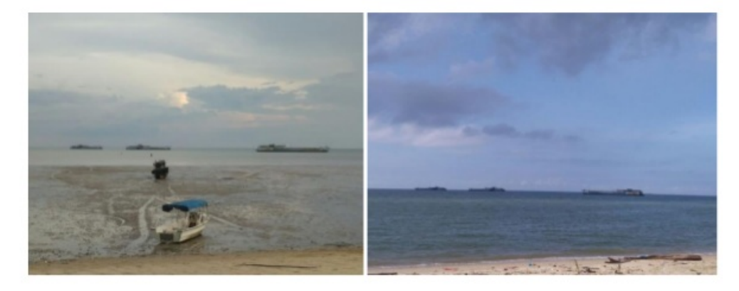
Fig 2. The irony of fisherman life and KIP activity

These minor rejections were actually meaningless. Other than outnumbered, this rejection might not also be channeled in the middle community and apparatus pragmatism that have made peace with KIP on behalf of compensation as occurred in some other regions (see Ibrahim, 2015; Ibrahim et al. , 2017). One of the citizens, Sahrul (interview 13/4/2018), even said that almost all local citizens received the existence of KIP in the name of solidarity. In the case revealed by Wahyu (interview 13/4/2018), of 700 householders in his region, 6 people stated as refused. The real interest was not balanced, between making a profit in the middle of ocean damage and little compensation; a pragmatism that is not clearly and openly staged.