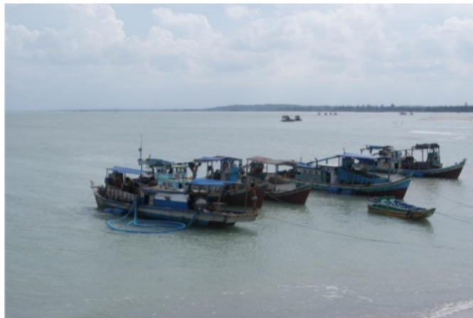
Figure 2: Fishermen's ships mingling with 'apung' unconventional mining

The fishermen's disappointment record often ended with demonstration, reserve, hijacking, or burning. However, tin exploration ambition has defeated rationality. The prove is that the businessmen never lose their mind to make approach, either by giving concessionary concession in money for the the surrounding fishermen or by giving lure to get facilities.