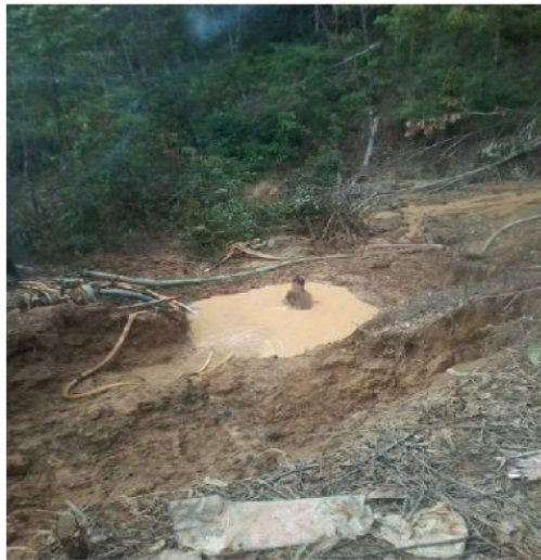
Figure 6: Mining in forest area

In this case, local people, either directly affected by environmental damage or non-victim of tin mining that doesn't pay attention to the carrying capacity of the the natural environment. Since the tin mining has been rampantly occurred, flood disaster as a result of the soil absorption capacity reduction often takes place. On January 2016, there was huge flood soaking almost all area in Bangka Island. This severe flooding has never been happened during the last 30 years in this island. On July 2017, there was a huge flooding soaking almost all of East Belitung Regency region signing that tin mining will in turn torment the people who live in that area (see also Bangka Pos, 25/7/2017).