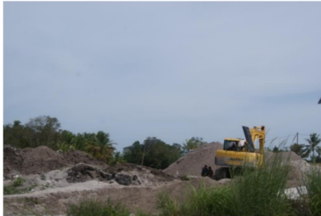
Figure 1: Mining expansion in the area around plantation

This condition caused the farmers who were previously plantation tiller patiently turned to be the victims. The author understood that farmers would in turn be in trapped by the temptation of high income; however, in short term vision. People's economy experienced shock when mining activities were not active anymore and at the same time, the plantation land had been ruined and difficult to rehabilitate.