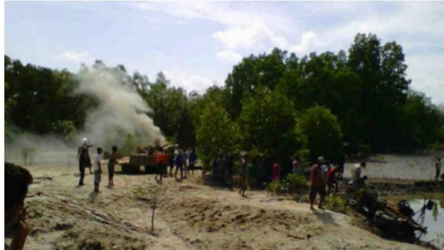
Figure 5: Unconventional mining equipment was burnt by people

based on social jealousy, land seizure, the decreased income of local people, or because of the changing value and culture between new comers and local people.