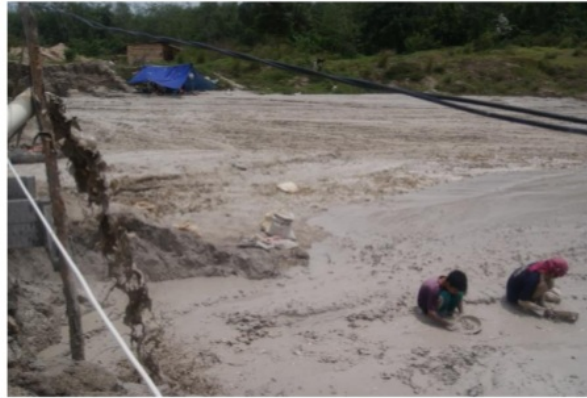
Figure 4: Children's exploitation in tin mining