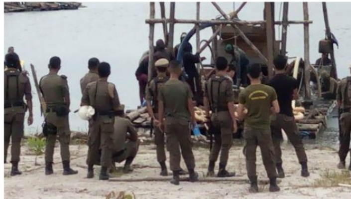
Figure 7: In conventional Mining Control in Bangka Tengah Regency