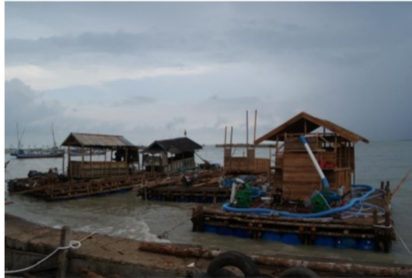
Figure 3: Apung Mining in the coastal area that destroy the beach beauty