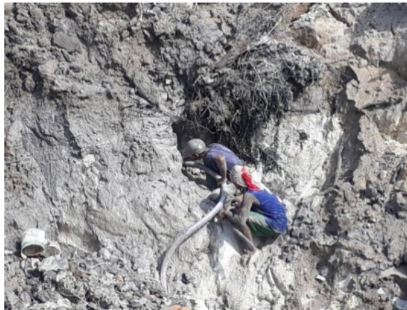
Figure 8: The mining in South Bangka, A Risky Job